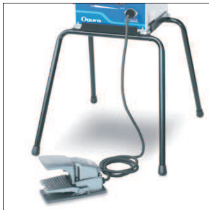
Optional Foot Pedal and Stand